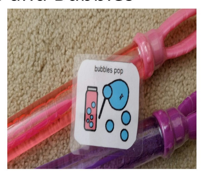
And will sing and have fun together