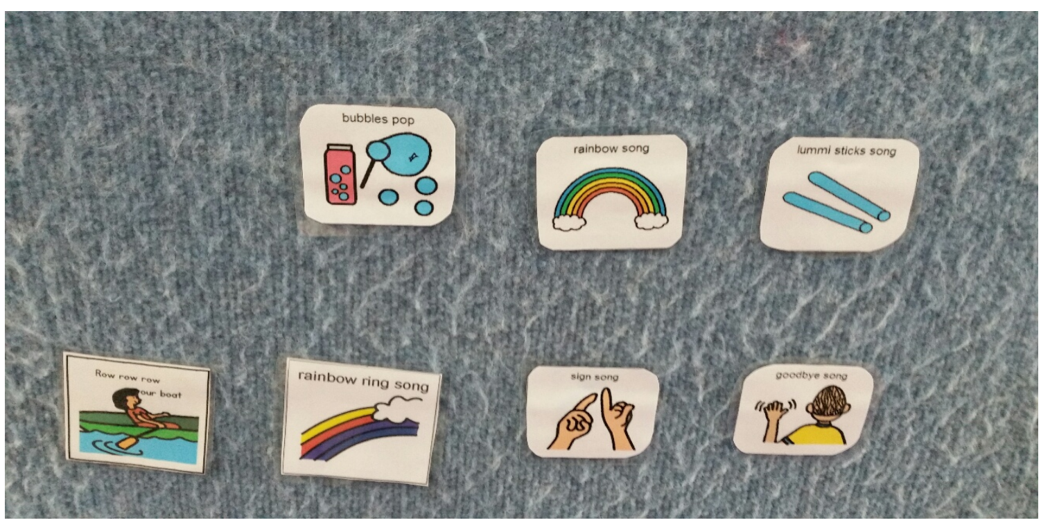
And lots of songs