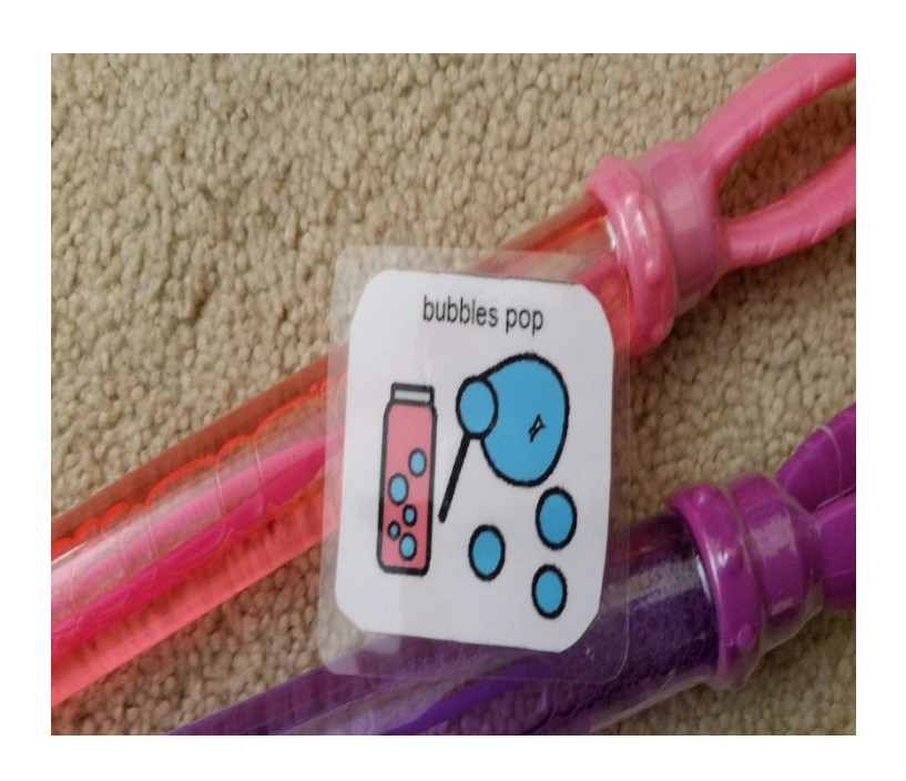
And lots of other songs